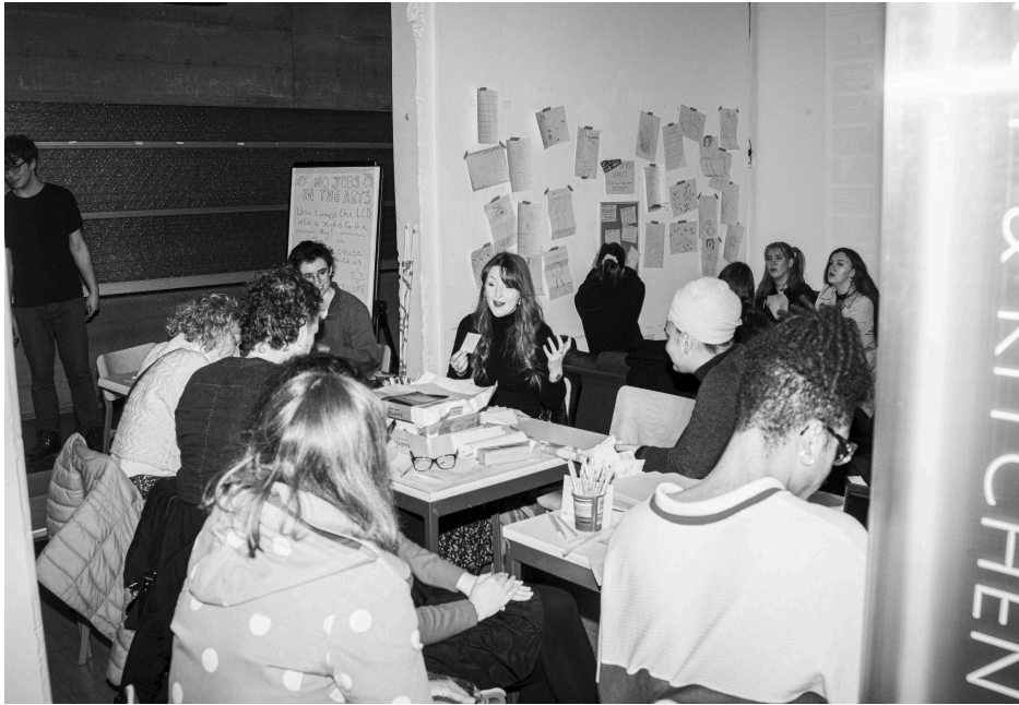
Fringe of Failure , 2022, a daylong festival of in-person workshops, at LCB Depot Leicester.